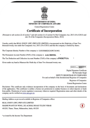
Certificate of Incorporation

Guidelines for Good Manufacturing Practice (GMP)